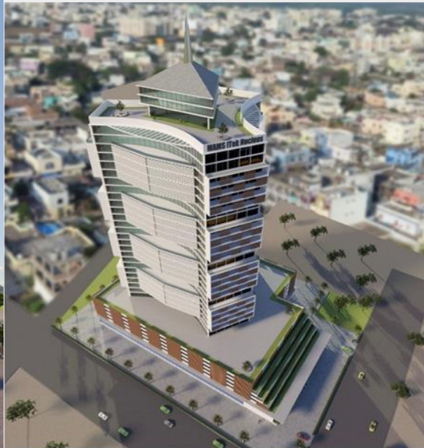
Master Plan Layout